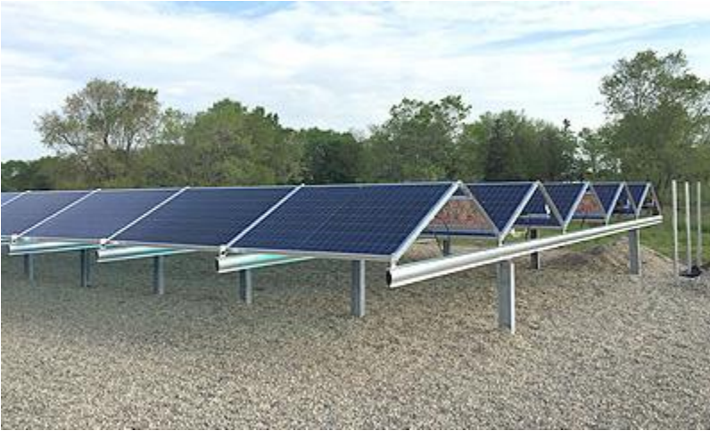
Runestone Electric Association's 44 KW Community Solar Alexandria, MN