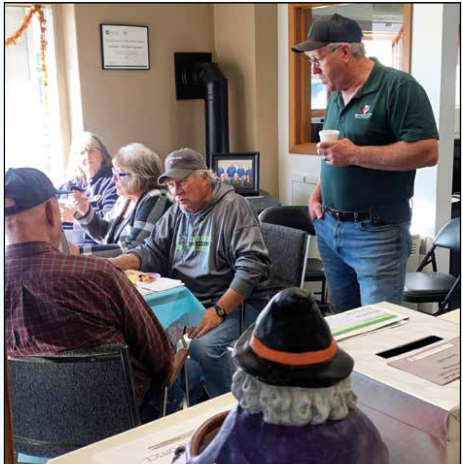
More open house photos on page 6

Thank you to all of you who stopped by to help celebrate Co-op Month and make our open house a great success!