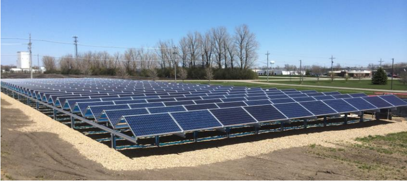
Steele-Waseca Cooperative Electric's 100 kW Sunna Community Solar Garden Owatonna, MN