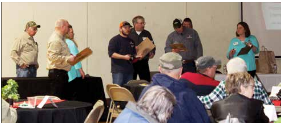
Drawing winners announced at Clearwater-Polk Annual Meeting.