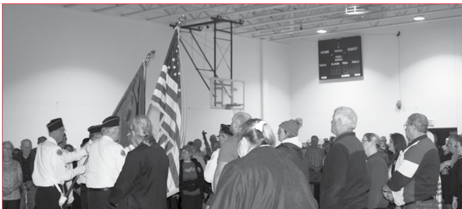
Retiring the colors.