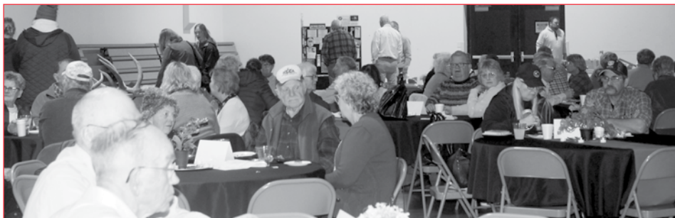
Clearwater-Polk members enjoying a meal.