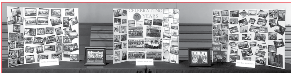
History display at the Clearwater-Polk Annual Meeting.