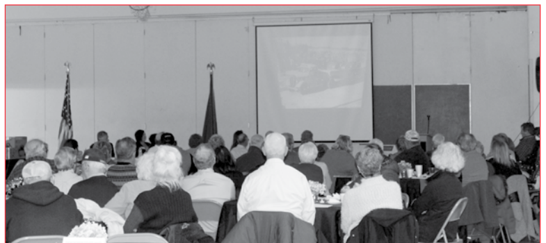
Clearwater-Polk members watching a documentary video on the history of the Co-op.