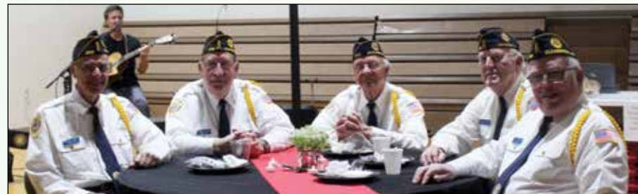
Clearbrook Legion Post #256.